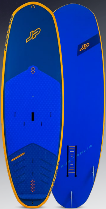
FOIL SLATE IPR