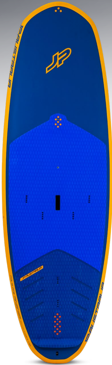
FOIL SLATE IPR