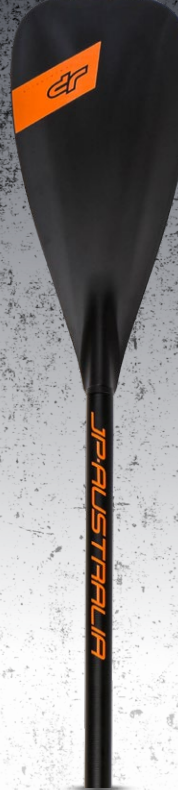
GLASS PE 3PC

BLADE MATERIAL FIBERGLASS SHAFT MATERIAL FIBERGLASS BLADE Y DIHEDRAL BLADE