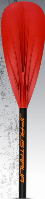
GLASS PE 2PC SMALL

BLADE MATERIAL POLYETHYLENE (PE) REINFORCED WITH FIBERGLASS SHAFT MATERIAL FIBERGLASS BLADE V BLADE