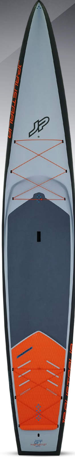
ALLWATER GT BIAX