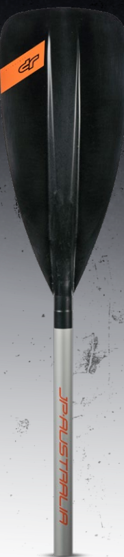
ALU NYLON 3PC

BLADE MATERIAL FIBERGLASS REINFORCED NYLON SHAFT MATERIAL FIBERGLASS BLADE CONVEX NYLON BLADE