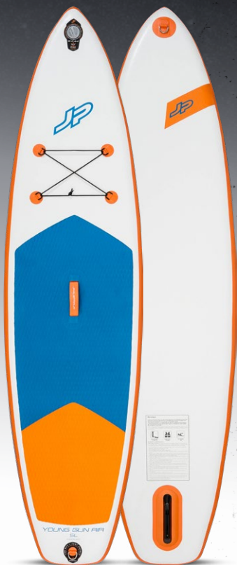
KIDS YOUNG GUN AIR SL

The secret of a fast board lies in the narrow outline, pointy nose, great gliding and stiffness. These principles were applied to the SportstAir to make it the fastest i-SUP available. Recently the SportstAir line was totally renewed and delivers even better performance. Its shape - with an outline developed by Werner Gnigler - has a thinner nose to allow better gliding after each stroke. With this board, it is finally possible to reach high-performance and pack it into a compact bag!