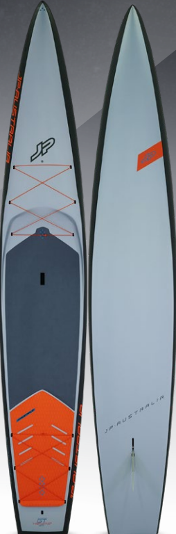
ALLWATER GT BIAx