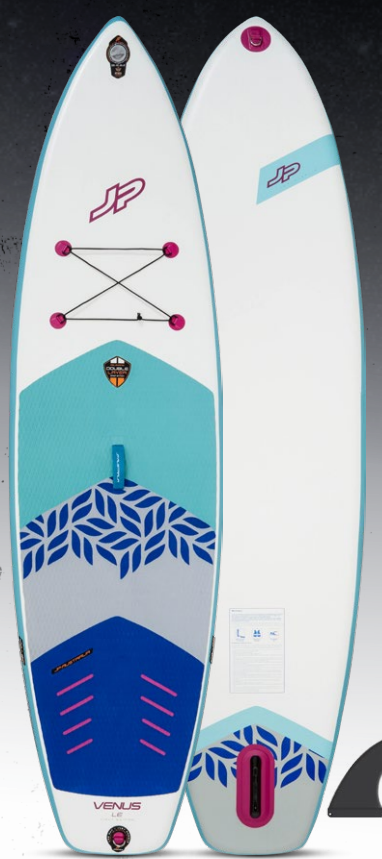
WOMAN VENUS LE

Same proven outline from the AllroundAir line scaled down to the proper size for the kids. The width of the kids shoulders require a narrower board so that they can maintain a straight line paddling. With a very wide board they will inevitably paddle too wide around and consequently have to change paddle side too often. Comes with a bungee cord in the front.