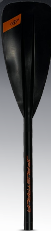
GLASS NYLON 2PC · 3PC

BLADE MATERIAL POLYETHYLENE (PE) REINFORCED WITH FIBERGLASS SHAFT MATERIAL FIBERGLASS BLADE SOFT CONCAVE BLADE