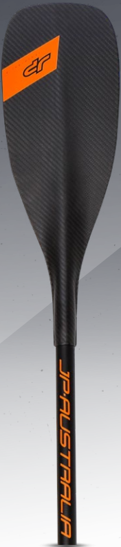
CARBON GLASS 2PC · 3PC

BLADE MATERIAL 100% Carbon SHAFT MATERIAL 60% PRE-PREG CARBON BLADE JP Concave V Blade