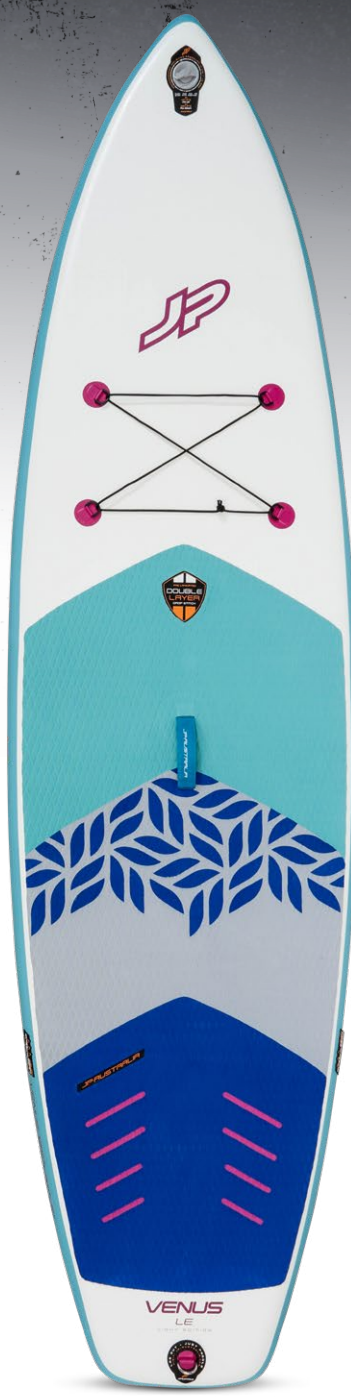
WOMAN VENUS LE