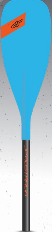
GLASS 2PC · 3PC

BLADE MATERIAL 100% Carbon SHAFT MATERIAL FIBERGLASS BLADE Y DIHEDRAL BLADE