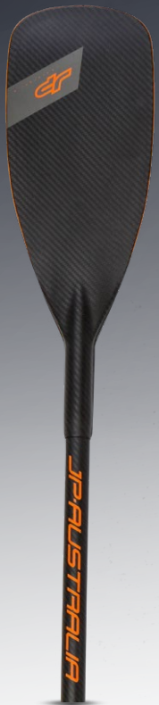
CARBON CTL · 2PC · 3PC

BLADE MATERIAL 100% Carbon SHAFT MATERIAL 100% Pre-preg Carbon BLADE JP Concave V Blade