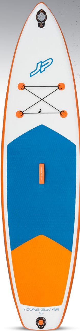
KIDS YOUNG GUN AIR SL