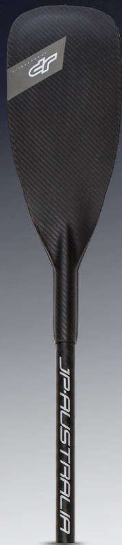
CARBON PRO CTL · 2PC · 3PC